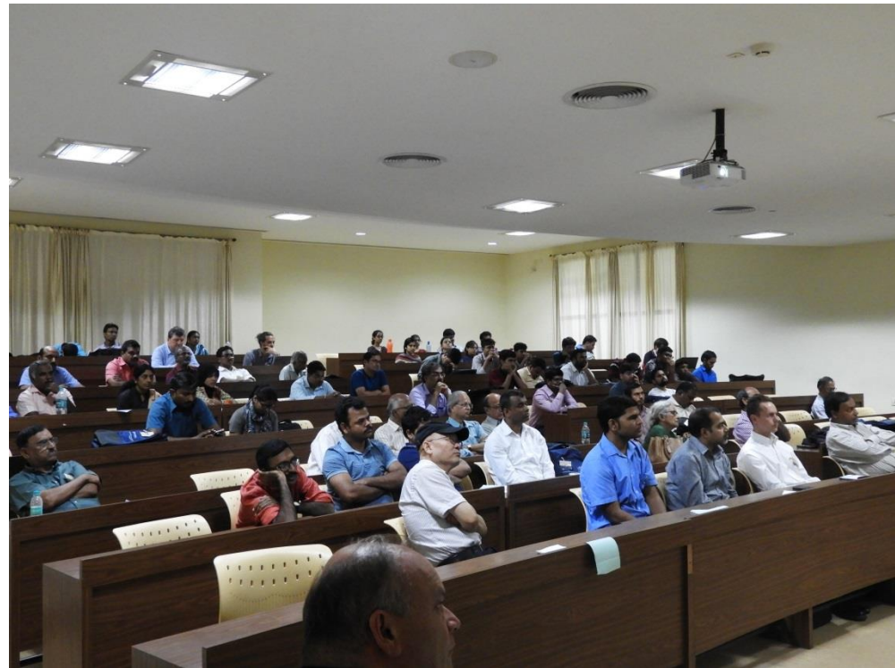
Day 1, Session