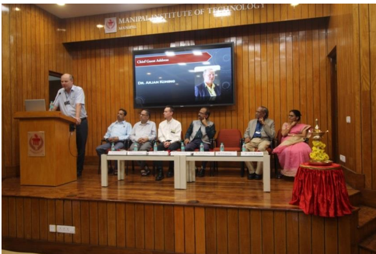
Inaugural Day Function